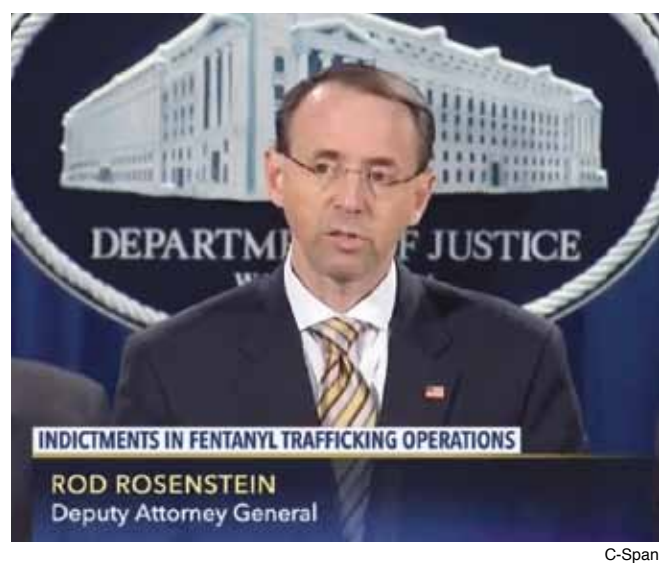
Deputy Attorney General Rod Rosenstein.

So, when people talk about Deep State or other phenomena, and don't identify the British role in this; when they opportunistically keep within the geometry of being anti-Russia, they not only miss the point, but they fail to identify the enemy that's actually involved in subverting the United States of America. It's critical that that be done. And it's what we have done with the dossier on Mueller.