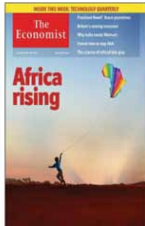
British magazine is forced to recognize the changing face of Africa