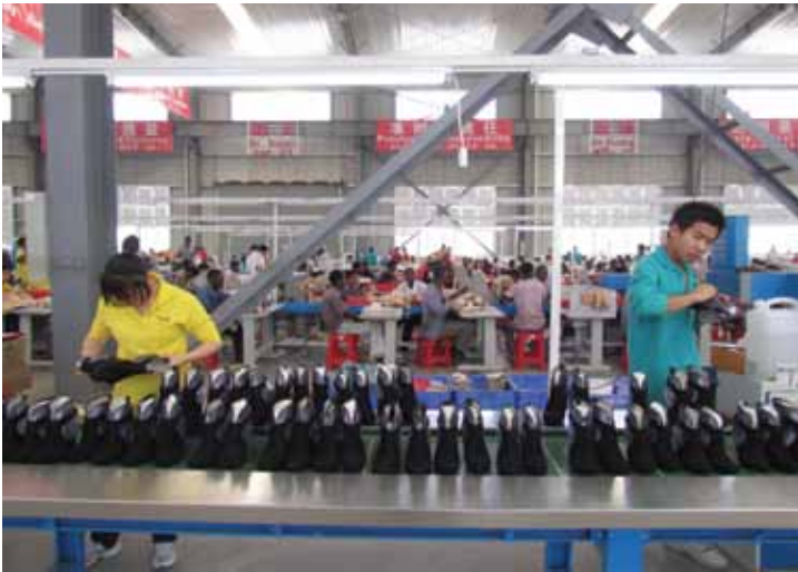
Shoe factory in Ethiopia (above and below)