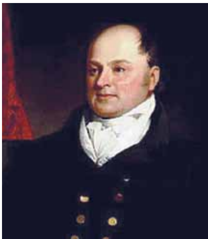
John Quincy Adams (1767-1848)