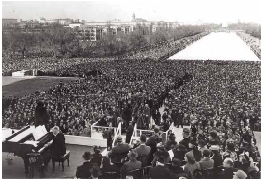
U.S. Information Agency

The Classical musician of African-American descent has never enjoyed the luxury of divorcing the mission to recreate a truthful and unique Classical musical performance from a deep reflection upon his or her own immortality. Such musicians often recount the experience of an “extra-musical,” involuntarily imposed daily fight for, not their own humanity, but the humanity of all others—just in order to properly perform their music. The peculiar conceits of racialism are refuted by their very existence. Their living embodiment of Clas-