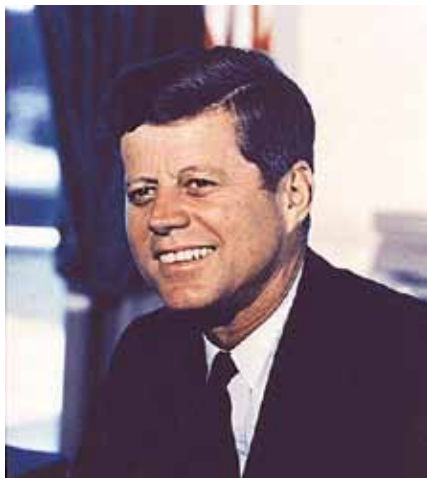
John F. Kennedy (1917-1963)