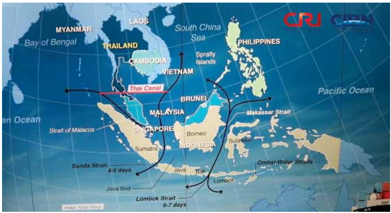
Strategic location of the proposed Thai Canal.