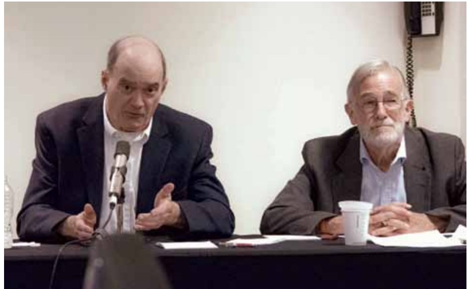
William Binney (left) and Ray McGovern, both of the Veteran Intelligence Professionals for Sanity, addressed the Sept. 9 EIR conference in New York.

Binney’s revelation was not beside the point, especially when presented to New Yorkers on the weekend of the 16th anniversary of 9/11, the September 11, 2001 killing of 3,000 persons at the World Trade Center’s