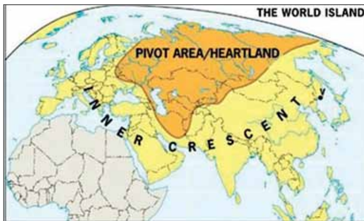
The British geopolitical view of the world as described by Halford Mackinder.

This is the policy that was implemented under Zbigniew Brzezinski during the Carter Administration. It’s continuing today, with the regime change policies in Libya, and in Egypt, before it was reversed by el-Sisi against Morsi. We see it in Iraq beginning in 2003; we see it today in the attempt in Syria. Before that, we saw it in Afghanistan, and that’s still a crisis today. We see it in Ukraine, today. This is the geopolitical policy of the British, which led to World War II by the way, because this was the policy of Hitler. The Mackinder policy was picked up by Haushofer, who was instrumental in defining Hitler’s policy of marching East to Russia—the Soviet Union at that time. So this is the geopolitical policy which is operative today.