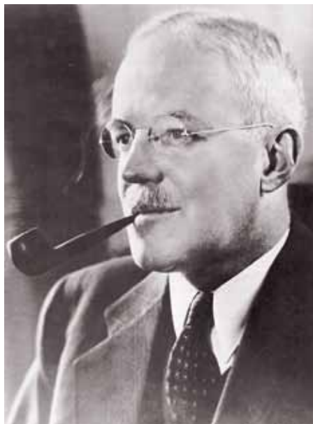
Former CIA director Allen Dulles.