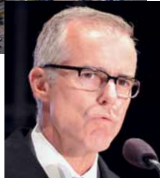
FBI deputy director Andrew McCabe.

information from Russians, which in this case is not very reliable; we have the use of all of this as a road-map for launching an investigation of the President of the United States after he was elected.