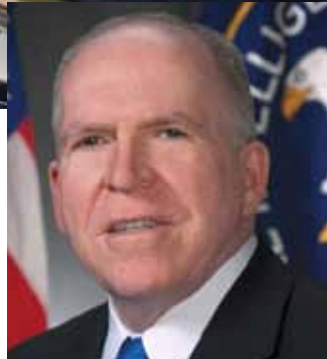
John Brennan, former CIA director.