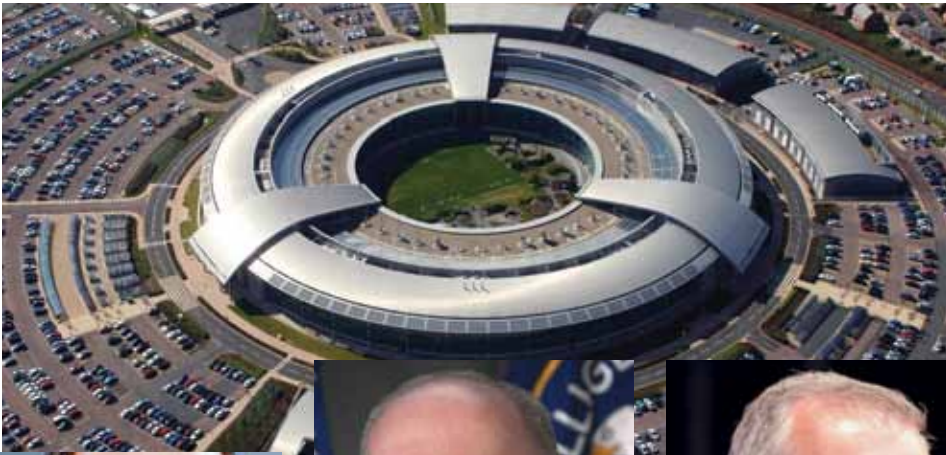
British Government Communications Headquarters (GCHQ)