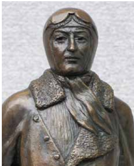
From a statue of Sir William Stephenson (code named Intrepid).

In 1946, the “British-U.S. Communication Agreement” was signed as a secret treaty. It was an agreement to have intelligence collaboration between the United States and the U.K. with respect to the Soviet Union and the East Bloc