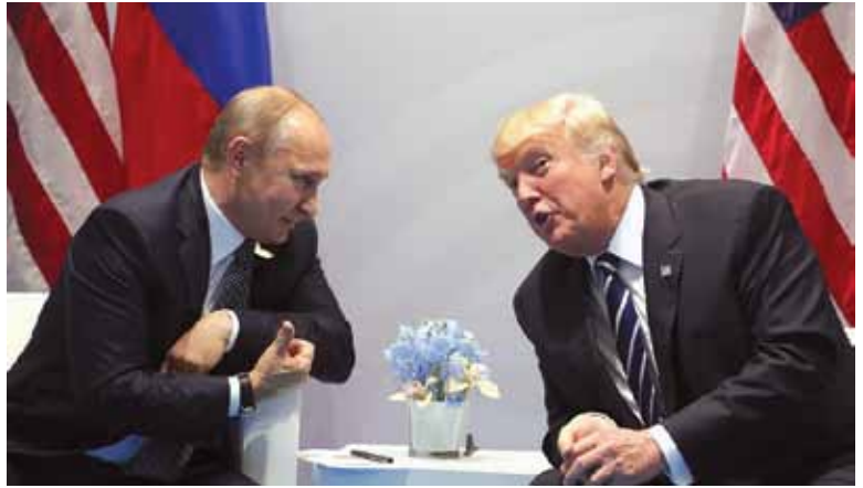
Russia President Vladimir Putin and President Donald Trump met at the G-20 summit in Hamburg, Germany, July 7, 2017.

Let me just situate this in the context of the July 7-8 G-20 meeting in Hamburg, Germany, where two events had positive implications. Everybody is aware of the fact that the demonstrations and riots that took place in the streets in Hamburg, were horrible, but two excellent developments emerged from the summit. One development was the historic meeting between President Trump and President Putin. This potentially represents a complete breakthrough. It opens the possibility for a new detente, and the reason it is a big success is that the neo-liberal establishment of the trans-Atlantic sector has tried to prevent this in the last six months with the so-called Russia-gate affair.