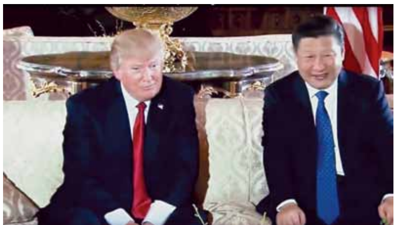
President Trump and President Xi Jinping at their April 6, 2017 meeting at Mar-a-Lago.

In my view, this anti-Russia attack had only one aim—namely, to prevent President Trump from fulfilling his promise to improve relations with Russia once he was elected President. The accusation that he may have been given the election as a result of Russian collusion, was designed to prevent him from realizing the improvement of relations he wanted. Therefore, in a certain sense, I think the two Presidents, Putin and Trump, outfoxed their opposition and, according to Tillerson, the Secretary of State, the chemistry between them functioned well. Russian Foreign Minister Lavrov