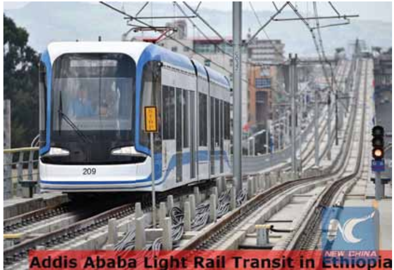
A passenger train on Chinese financed and built light rail in Addis Ababa, Ethiopia.

China is building railways in Nigeria; it is now looking, together with Italy, at the largest infrastructure