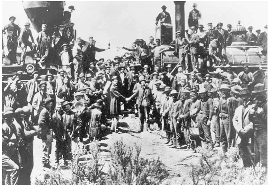
The driving of the ceremonial golden spike in Promontory, Utah, on May 10, 1869, that completed the nation's first transcontinental railway.

Since Alexander Hamilton breathed new life into our nation with the creation of the U.S. Constitution and the recruitment of George Washington to launch our new Republic as its first President, it has always been the case that the prin-