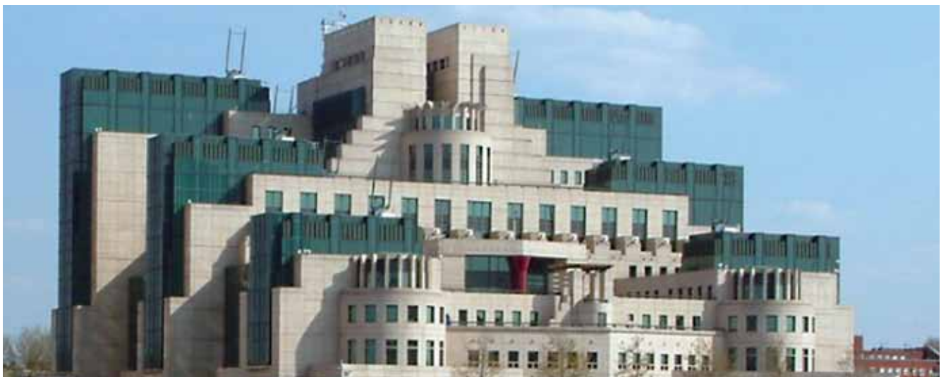
The MI6 Building in London, 1994

Of course, this, to a certain extent, started with the release by MI-6 operative Christopher Steele of the 35-page notorious document full of absolutely crazy, made-up stories about how Donald Trump was being blackmailed by the Russians because they caught him cavorting with prostitutes, urinating on prostitutes, God knows what else. This Christopher Steele, an MI-6 operative, had been hired by the Democratic Party, the