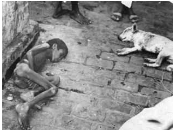
By 1943, hordes of starving people were flooding into Calcutta, India, and many of them died. Churchill refused to send wheat, saying that they were "breeding like rabbits." According to Malthus, famine is nature's way of culling such "excessive" population.

Recently, a new book was published by Shashi Tharoor. He's a very prominent personality, a Member of Parliament in India, a diplomat, a very educated fellow, who has been going after the British full tilt. He's just published a book called Inglorious Empire: What the British Did to India . He points out that in 1700, before the complete British takeover, India was the richest nation in the world. It had, according to him, 27% of the global GDP of the world; whereas the British had 1.8%. I don't know if that's true; I haven't read this book yet. But he does point out what I do know is true, which is that under the British, in one year, in 1837, 35 million people starved to death [in India], while the British were shipping wheat and other foodstuffs out of the country back to Britain. The British argument was "we don't interfere with famines, because famines are nature's expression of the limit of population. They had become overpopulated, and nature stepped in to cull the herd of the human beings. After all, we are moral people in the UK, and we believe in the morality of contracts. And to break a contract that sends the wheat back to the United Kingdom would be absolutely im-