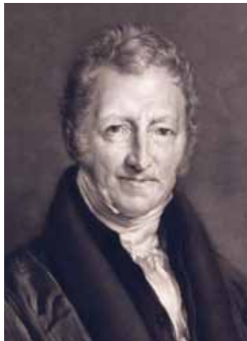
Pastor Thomas Malthus maintained there was a limit to the Earth's human population because there was a limit to resources.

As I said, to return to the political side of this: the basic division of the British Empire, historically, has been this "East versus West" divide. Rudyard Kipling, one of the "geniuses" of the British imperial age, had the famous saying, that "East is East, and West is West, and never the twain shall meet." These are almost different species. Rudyard Kipling, in fact, praised the British Raj for "bringing civilization" to the Indians.