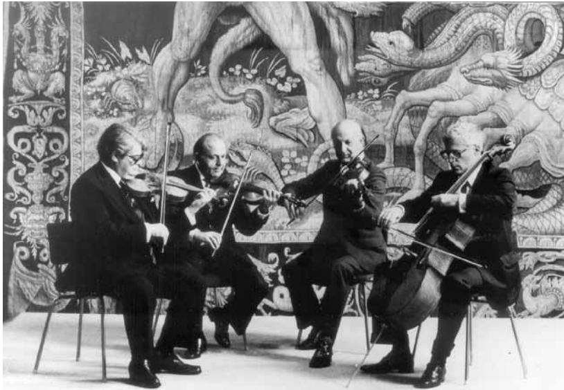
The celebrated Amadeus Quartet in performance. Their genius lay in playing together “between the notes,” bringing out the unity of the Classical composer’s idea.

with those Classical expressions of irony which define the ironical principle of movement in poetry and Classical tragedy.