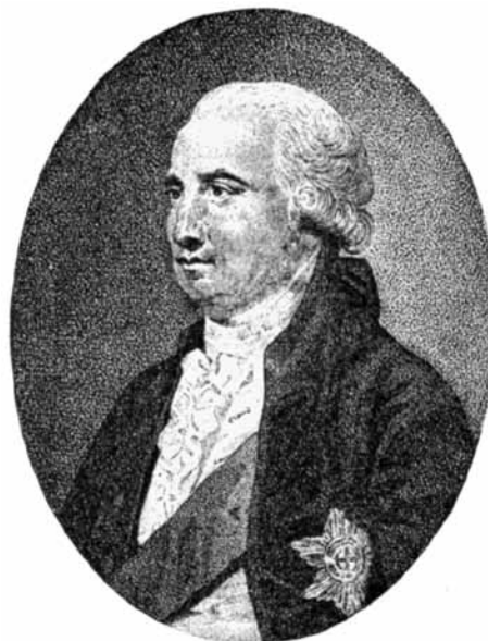
Lord Shelburne (1737-1805) of the British Foreign Office "preferred the methods of the Venetian stiletto to the costlier enterprise of frontal bayonet charges. Thus he used Adam Smith and the Martinists to launch subversive operations against both France and the English colonies in North America."

That was the same Martinist order, under the leadership of that Count Joseph de Maistre who crafted the personality designed for, and adopted by Napoleon Bonaparte for the latter's transformation from a Robespierre asset into the great monster whose wars, by 1815, had created a situation of subsequently ricocheting effects, from which continental Europe has never fully recovered, to the present day. Indeed, Joseph de Maistre's design for what became known later as the Napoleonic imperial model used under the rubric of Synarchism , was the basis for the launching and continuing deployment of the European financier-created model of Mussolini and Hitler, including the de Maistre-prompted persecution and mass-murder of Jews by the Nazi dictatorships during the 1922-1945 post-Verdun Treaty interval.