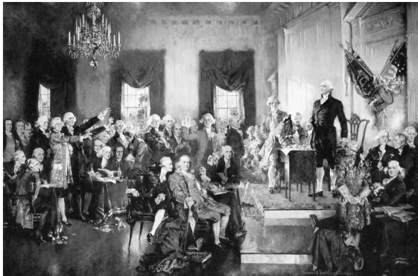
"The U.S.A. was built by Europeans." The principles of the commonwealth and promoting the general welfare, affirmed by the Council of Florence (1431-1445), were the inspirations for the U.S. Declaration of Independence and the 1789 Federal Constitution, Here, George Washington presiding over the 1789 Constitutional Convention, as depicted by Howard Chandler Christy.

Since mankind is a higher quality of existence than life itself otherwise, what, we might ask, is the natural self-interest of humanity, beyond the reach of mere biology as such? What, consequently, is the natural self-