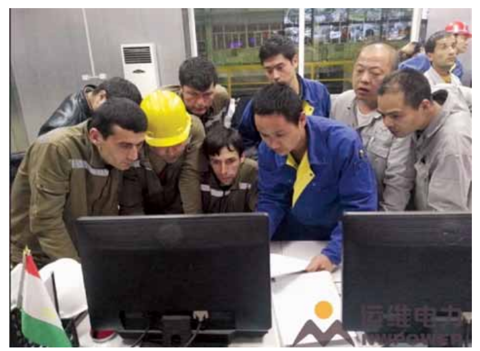
NWPower/www.ompower.cc/english Tajik and Chinese at work at coal-fired power plant in Dushanbe, Tajikistan.

was only the start. "Here, across 70 hectares of land, there are plans to create a Tajik-Chinese industrial zone. We will build five industrial enterprises," Panteleyeva was quoted as saying by RFE/RL's Tajik service, Ozodi. Clearly, Tajikistan is veering increasingly toward China for building its economic strength.