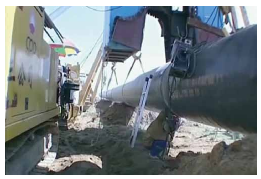
Laying the Central Asia-China Gas Pipeline's Line D across Tajikistan.

cilitates the transit of consumer goods from China to Central Asian markets. In certain sections, particularly where it crosses international frontiers, the road is of good quality. But much of the highway is unpaved, and it takes several days to journey from Dushanbe to Kashgar, the westernmost urban center in China. The distance is not so great, around four hundred miles, but the altitude and poor road quality makes for slow traveling.