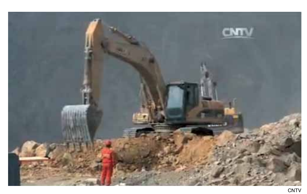
Roadbuilding, financed by China, to integrate Kyrgyzstan.

Beyond these modest developments, however, Kyrgyzstan has yet to benefit in a major way from the China OBOR policy. There are many problems. About forty percent of Kyrgyzstan's GDP comes from expatriates