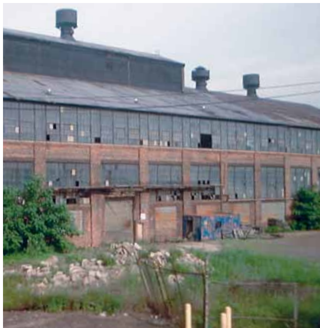
A decaying former factory in Newark, New Jersey.