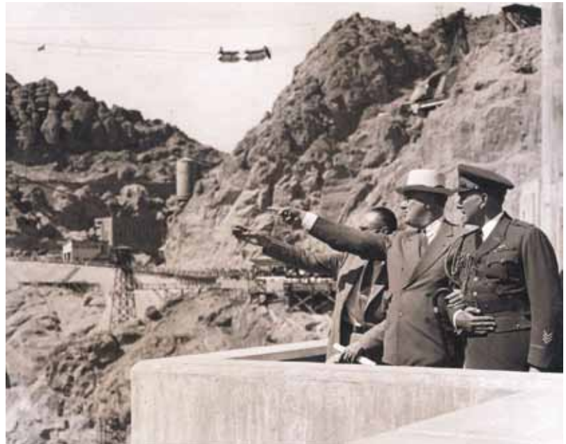
President Franklin Roosevelt inspecting the construction of the Boulder Dam, Sept. 30, 1935.

• The purpose of the use of a Federal Credit-system, is to generate high-productivity trends in improvements of employment, with the accompanying intention, to increase the physical-economic productivity, and the standard of living of the persons and households of the United States... to create a general economic recovery of the nation, per capita, and for rate of net effects in productivity, and by reliance on the essential human principle,