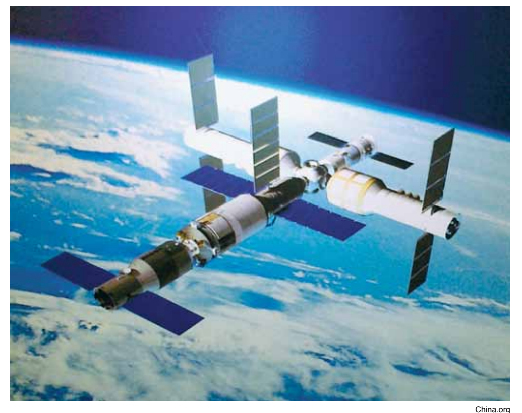
An artist's rendition of China's planned 60-ton, multi-module space station, set to be established in orbit by 2022.

New international leadership is coming into being, making bold decisions to act for the future of mankind. As a feature of this process, a new era of space exploration is opening, prompted by the initiatives of China, Russia, and India, in cooperation with developing nations and their scientists and engineers. It is infectious! Yet here in the United States, we are still operating under the bankrupt Bush-Obama policies, bipartisan Congresbudget-cutting sional