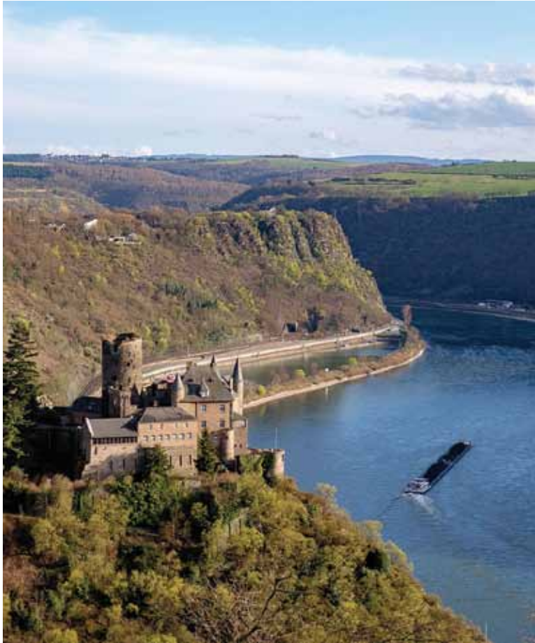
The Westerwald-Taunus Tunnel is proposed as an alternative to the present route on the bank of the Rhine River, shown here as it passes Burg Katz. The present rail infrastructure is more than 150 years old and has a limited load-bearing capacity for the 400 freight trains which pass through this section daily.

tunnel will traverse a straight line beginning at the town of St. Augustine, east of Bonn and not far from the two railway marshalling yards at Cologne. It will terminate at Hochheim near Wiesbaden, where it can connect with the rail line leading to the nearby Mainz-Bischofsheim marshalling yard. From there, various rail lines go south along the Rhine-Alpine Corridor, and there are also connections to lines going east and west. The route will be 50 kilometers shorter than the old 150-kilometer Rhine Valley route.