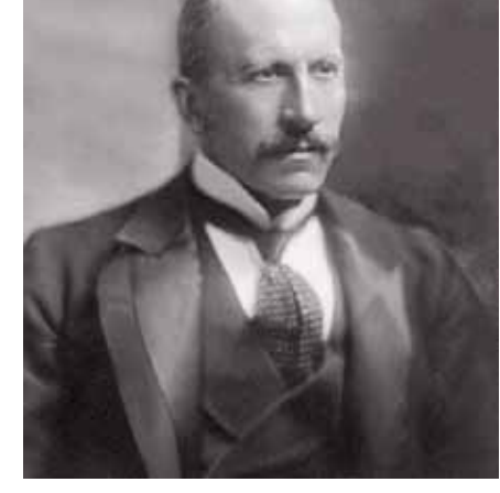
First Viscount Alfred Milner. Lord Milner played a leading role in implementing the domination of the world by the British Empire.

Who rules the World-Island commands the world.