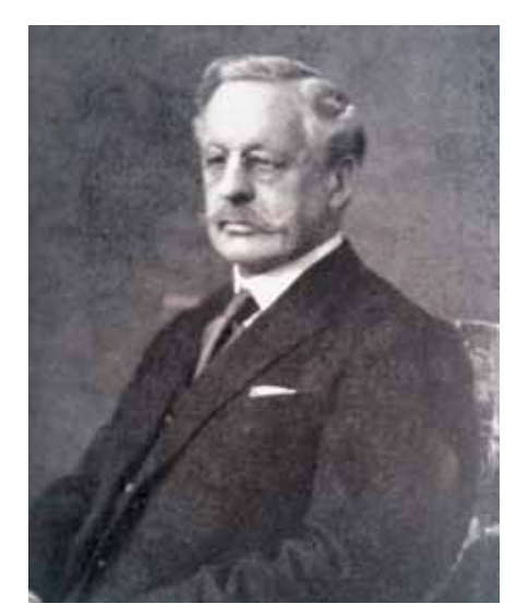
Halford Mackinder, the godfather of British Empire geopolitics.

The Russian railways have a clear run of 6,000 miles from Wirballen in the west to Vladivostok in the east. The Russian army in Manchuria is as significant evidence of mobile landpower as the British army in South Africa was of sea-power. True, that the Trans-Siberian railway is still a single and precarious line of communication, but the century will not be old before all Asia is covered with railways. The spaces within the