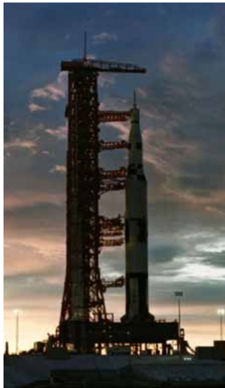
A Saturn V (500-Foot Test Vehicle) at Pad 39A at dawn in the Summer of 1966.

We, in the year 2000, look back at the twentieth century as the years in which the new era was finally born after centuries of incubation in the minds and hearts of great men and women of many nations. The twentieth century is the gulf which separates the last century of the old era and the first century of the new one in which values, outlooks and frames of reference are quite different. The hour of birth, be it of a life or of an era, is the hour of truth in which pain, doubt and fear challenge, and the intensity of their on-