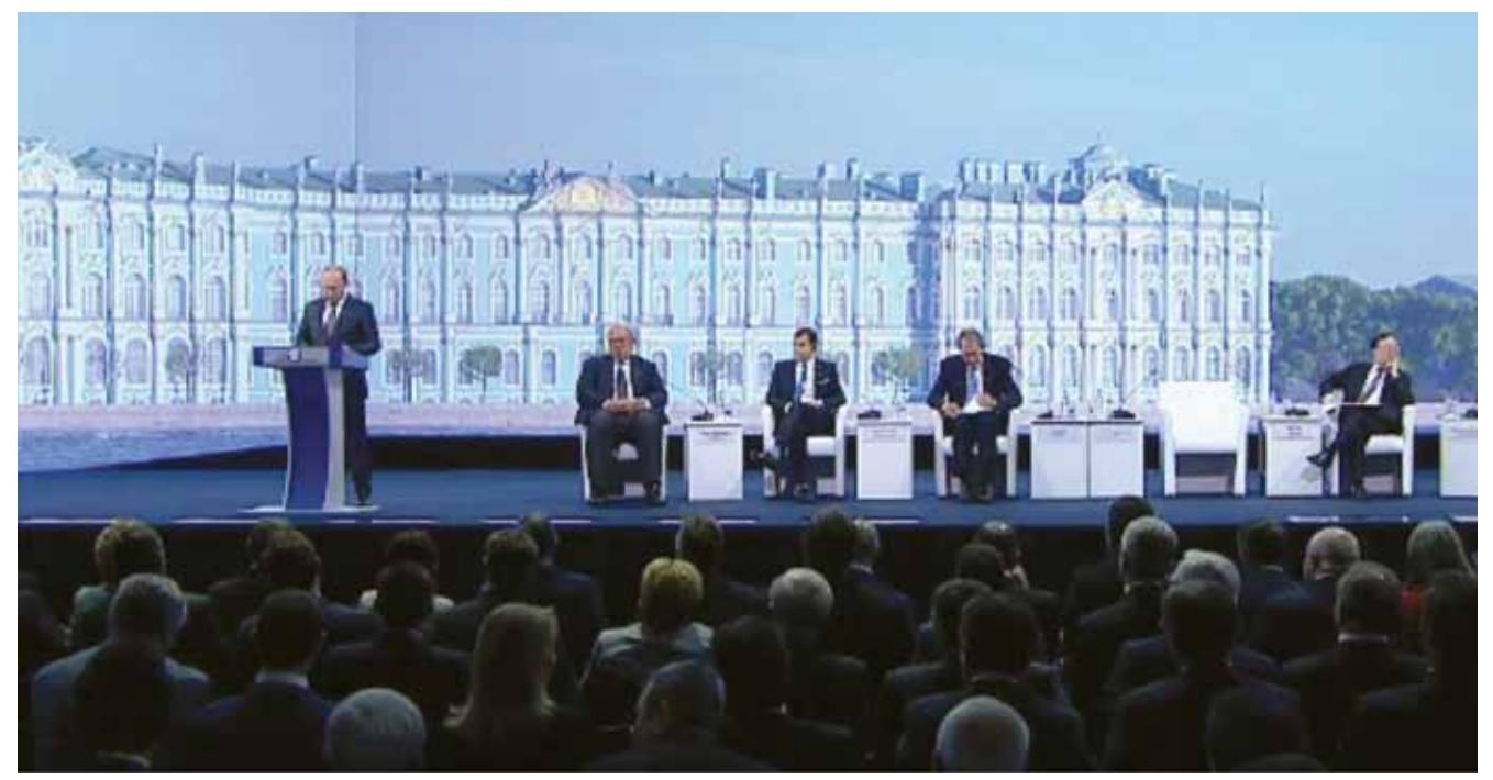
The plenary session of the St. Petersburg International Economic Forum.