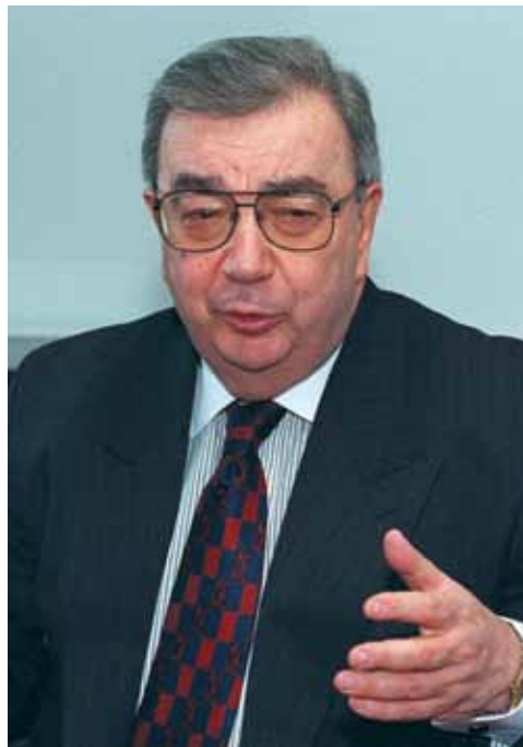
Former Russian Prime Minister Yevgeny Primakov played a key role in establishing the Strategic Triangle of Russia, China, and India, the precursor of today's BRICS.

In a 1999 video presentation called Storm Over Asia , Lyndon LaRouche issued the warning that these British Empire-directed forces would use mercenaries under the banner of Islam to light small fires of conflict, that would spread to regional war, and ultimately to world war using nuclear weapons. In the video presentation, LaRouche said: