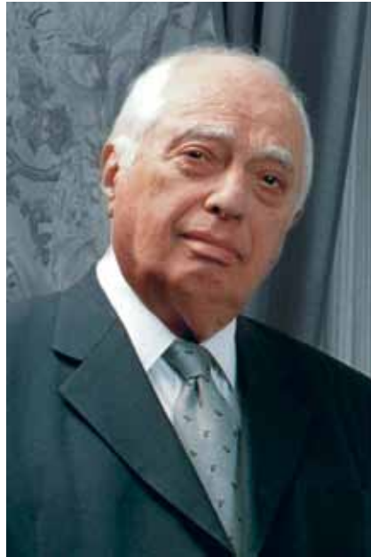
Standard You Tube License

In 1999, as the newly sworn-in Prime Minister under President Boris Yeltsin, Vladimir Putin faced his first challenge in the form of the Second Chechen War. Chechnya had become the home base for the mercenaries who had sharpened their teeth fighting the Soviets in Afghanistan under Osama bin Laden. This war against Russia was supported by the American Committee for Peace in Chechnya (ACPC), which included Brzezinski and a menagerie of neocons, including Robert Kagan, whose wife Victoria Nuland continues to play, from within the Obama administration, a key role in the irregular warfare against Russia after her instrumental role in orchestrating the coup in Ukraine. In 1997, Kagan would found the Project for a New American Century (PNAC), which included many of the neocons from the ACPC, to explicitly prevent the emergence of what would be-