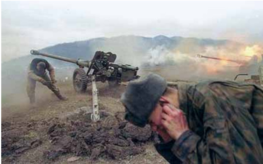
Russian artillery shelling mercenary fighters in Chechnya in January 2000.

Remember that Yevgeny Primakov first set forth the idea of strengthening cooperation in the Russia-India-China (RIC) troika format, which jump-started the evolution of geopolitical structures advocating multi-polarity and the formation of a polycentric world, where all positions and rights are distributed in line with a [country's] actual economic and financial weight, as well as political clout. RIC became a pioneer in this respect. Eventually, BRIC was formed when Russia, India and China were joined by Brazil, and now it is BRICS, with the participation of the Republic of South Africa. There is a growing number of countries lining up to join this organization as full-fledged members or as dialogue partners. 3