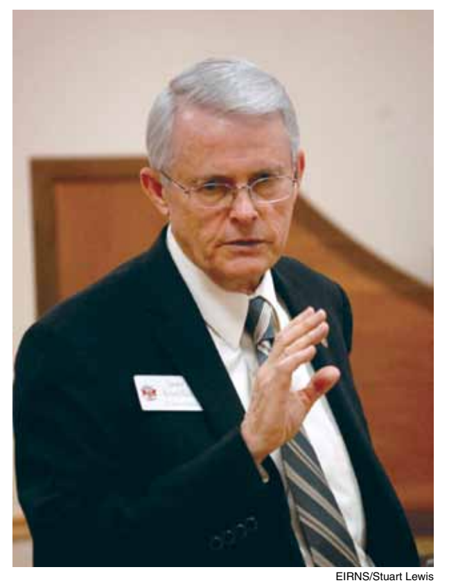
Virginia State Senator Richard Black

In his address, Black went on to emphasize the