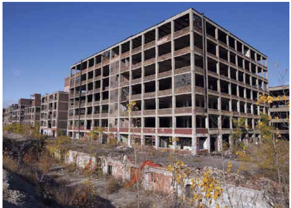
All the jobs are gone. How do we move beyond words and actually solve the problem? Here, the western part of the abandoned Packard Automotive Plant in Detroit, Michigan, in 2009.

Less so in Russia; Russia has better conditions, China has better conditions, other nations in that area have better conditions. Egypt, for example, has better conditions. So why are we saying this, that at some