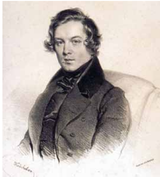
If you can inspire people to find that what they're doing is beautiful, and good, and resourceful, that is your best weapon! Only Classical artistic composition can do this. But you must deliver that medication. Here, composer Robert Schumann in a lithograph by Josef Kriehuber, 1839.

And what we're doing in most parts of the United States—look, Manhattan has a certain concentration of