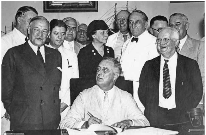
Roosevelt, with great difficulty, brought improvements for working people. Here he signs into law the Social Security Act of 1935, providing unemployment benefits, old age pensions, and welfare benefits for the poorest. Labor Secretary Frances Perkins, who drafted the Act, is directly behind him.

The United States, under Franklin Roosevelt was the great leader of the world. And it's only when he lost