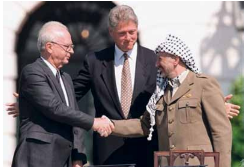
Israeli Defense Forces

On Sept. 13, 1993, after more than 45 years, the active war between the Palestinians and the Israelis fell quiet when Israeli Prime Minister Yitzhak Rabin and