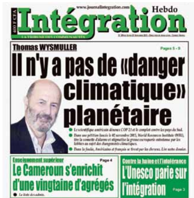
The Cameroonian weekly Intégration prepares its readers for the Paris “summit of depopulation.”

Wismuller: The context of that assertion was that we would revert to Stone Age conditions if every proposal, change, and energy-destroying wishlist item were to be enacted as a result of the Paris COP21 conference. It would mean that inexpensive coal-generated electricity would be barred in Africa. Developing nations would be limited to non-utility scale wind and