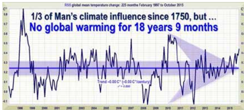
Roy Spencer, Remote Sensing Systems, Global Temperature Anomaly Troposphere/Stratosphere (TTS) data No global warming for 18 years and 9 months. If we look at the total emissions of CO 2 produced by man since 1750, we find that one third of these emissions occurred in only the last 18 years and 9 months. However, the most reliable satellite measurements of temperature in the upper tropical troposphere—where global warming theory predicts a “hotspot” due to warming sea surface temperatures and increased tropical convection—show no indication of global warming over this period. There is no evidence to support the claims that anthropogenic CO 2 emissions are causing a sudden, dangerous change in the Earth’s climate.