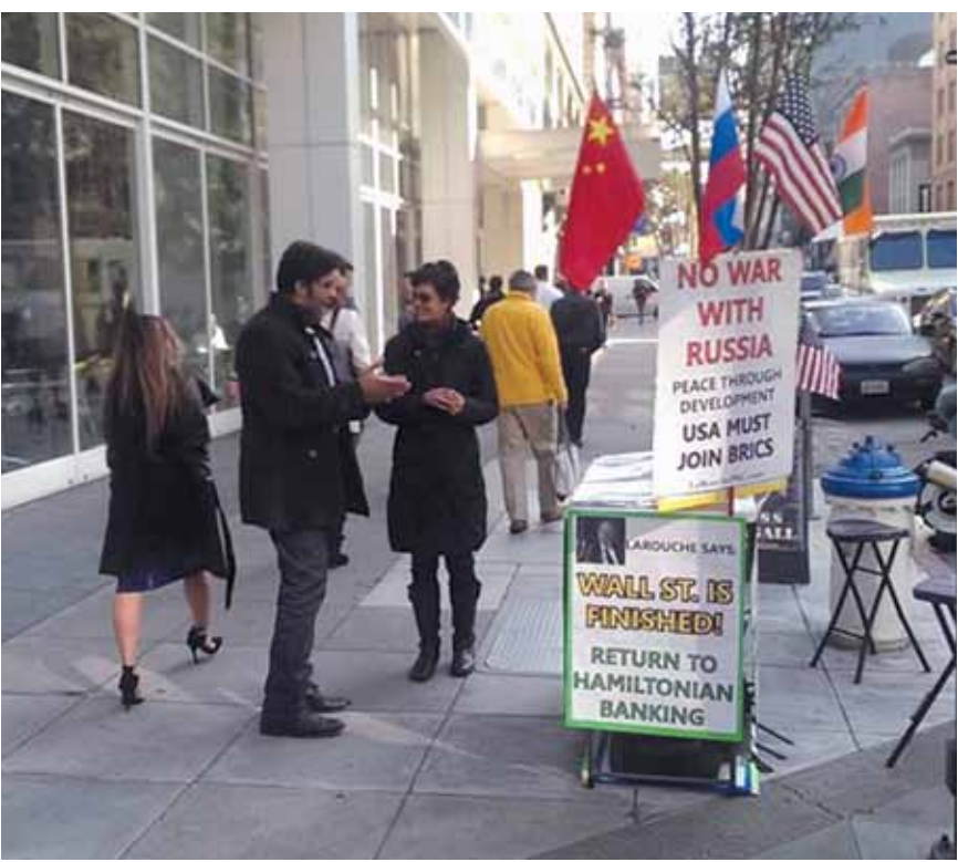
LaRouche PAC organizing in Manhattan.