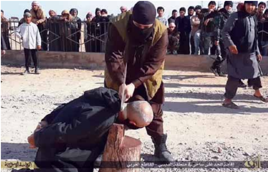
It is the brutality of ISIS which Syrian refugees are fleeing. Here, an ISIS member prepares to behead an unknown man outside its Raqqa stronghold.