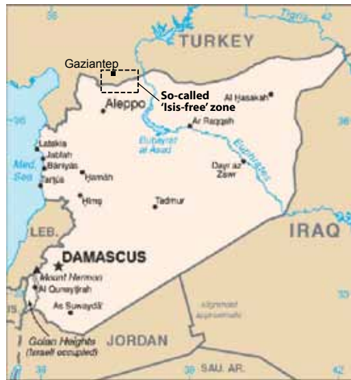
FIGURE 1 The Syrian Battleground

the entire Middle East region, he will put Obama in a real pickle. He also knows that this will deliver a dead-serious message to the Turkish military, and to President Erdogan and others in the AKP party in Turkey, that they’d better back off, because suddenly, there is a prospect of a much bigger and much more volatile war, if they persist in the plan to overthrow Assad, and create a Sunni-jihadist beachhead on the eastern Mediterranean.