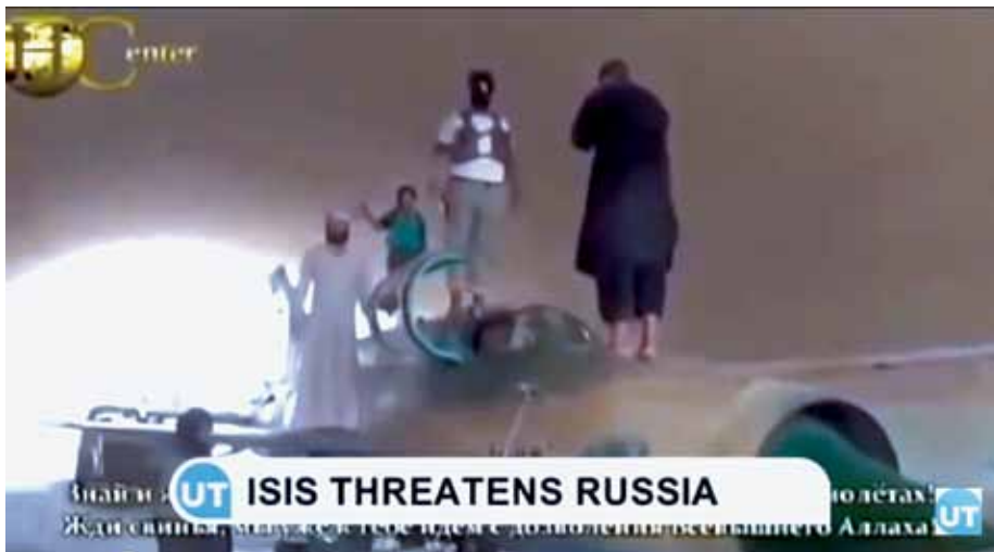
ISIS's direct threat to Russia was broadcast broadly in this ISIS video, dated September 4, 2014.