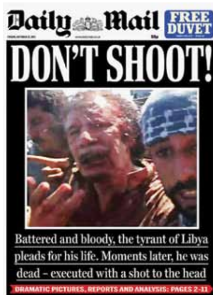
Blood on Obama's hands: Muammar Qaddafi, killed on October 20, 2011.

This is not a doctrine unique to the Obama Administration; this comes straight from the British. It comes straight from Tony Blair, who is being investigated as a war criminal for the Iraq war, another overthrow of the Westphalian system of national sovereignty. The policy in Libya was a complete continuation of the Bush/