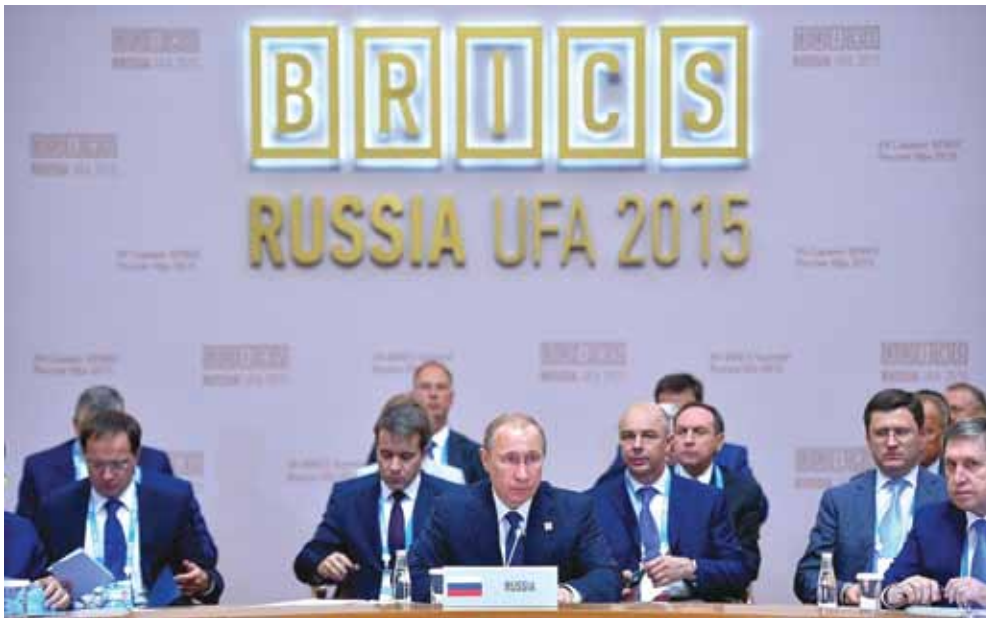
Russian President Vladimir Putin at the 7th BRICS Summit in Ufa, Russia on July 9.

leaders of the BRICS nations—Brazil, Russia, India, China, and South Africa—together with the leaders, and I think, the observers, of the SCO (the Shanghai Cooperation Organization), both of these organizations were meeting together in Ufa, Russia. . . . This occurred almost exactly a year after the Fortaleza summit last year in Brazil, which happened in mid-July.