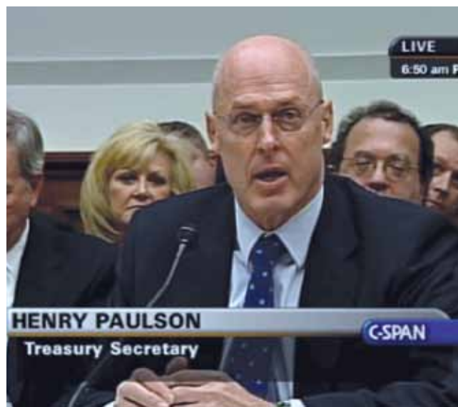
Bush's Treasury Secretary Hank Paulson, browbeating Congress into passing the bank bailout in November 2008.

You're going to take all of this—no insured commercial bank will be able to underwrite these deriva-