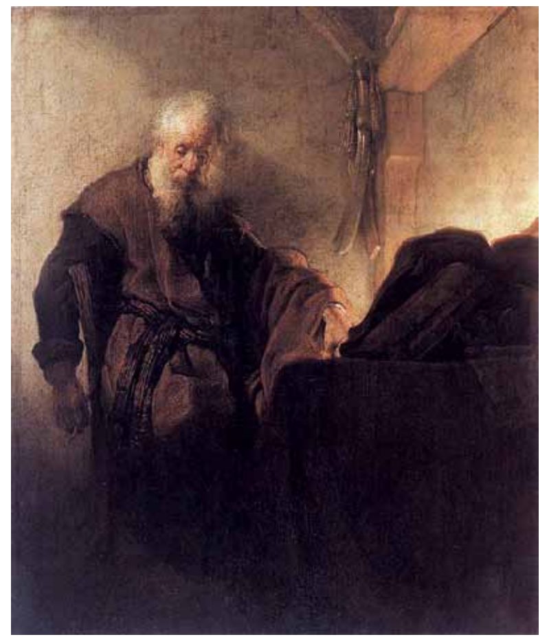
St. Paul at his writing desk, by Rembrandt van Rijn, 1629

"Corresponding to the power that works inwards, from the whole to the parts, a power which proceeds from a more or less complete vision of the whole, is an emotion that springs from the artist's relationship to the world at its most profound and most meaningful—an emotion one may call love, humility, reverence, worship, awe, and many other things ... a love of the world, which comes to us as the eternal gift of God. If only modern man would grasp that it is impossible to understand and shape the world as it confronts us without loving it! And that it is equally impossible to love it