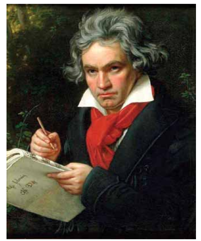
Ludwig van Beethoven, by Joseph Karl Stieler, 1820

Only by listening to the future , to that totality which can never exist in the sequential temporal experiences of the ear, but only in the imagination which can consider the entire composition as a one, existing as a unity outside of time. By hearing that single unified Being, and following it as it guides us through the inexorable evolution of its own Becoming. By allowing the inaudible echo of that yet-to-be-experienced future to resonate within the audible sounds of the present, each meeting and mutually interacting with one another at each un-