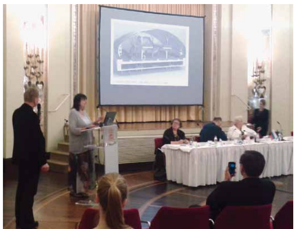
Cultural Business Dialogue

"So people also, step by step, perceive that China