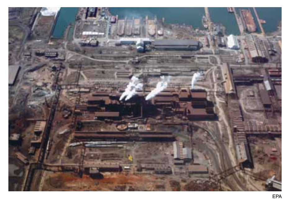
When Baltimore built the nation. At Sparrows Point, the steelmaking process was first integrated from the arrival of tankers with iron ore, to the shipment of finished steel, producing more than 3500 combinations and grades of steel—and enabled most Baltimore families to live on the income of one wage earner.

in a paddy wagon) that resulted in Gray's severed spine and ultimately, his death, was also black.