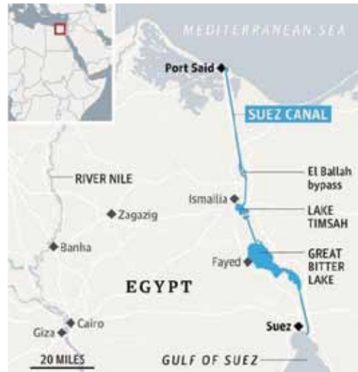
FIGURE 2 The Suez Canal

ever, the Canal's revenues will not exceed the transit fees.