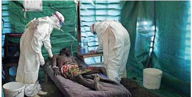
In Sierra Leone, 32 nurses, and an unspecified number of doctors, died from Ebola between May 24 and Aug. 13. Shown: an Ebola patient being treated in Sierra Leone.

The day before, an emergency hearing was held in the U.S. House of Representatives—despite Congress being in August recess—where lawmakers heard testimony from disease experts, who gave chilling first-hand accounts of the situation in West Africa, backing up their assessment that the epidemic is “out of control.” The stark reality of their testimony flew in the face of the official line that the crisis could still be contained, which was otherwise presented to the lawmakers by top officials of the CDC (Centers for Disease Control and Prevention) and USAID (U.S. Agency for International Development), who repeated the story that the disease can be “contained” in Africa, even though no proper international mass-mobilization of resources to combat and control one of the most virulent viral diseases known to man is being undertaken.