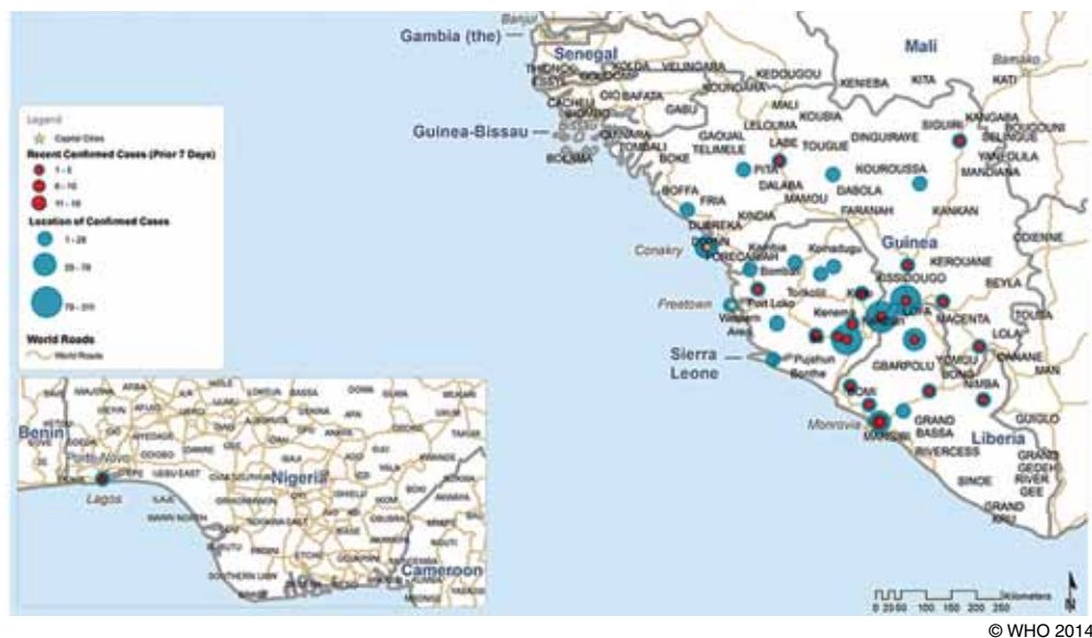
FIGURE 2 Confirmed Cases of Ebola

ernment hospitals essentially closed. Even patients refused to go into the hospitals. Nurses say they will return when they get protective gear, such as gloves, goggles, and gowns.