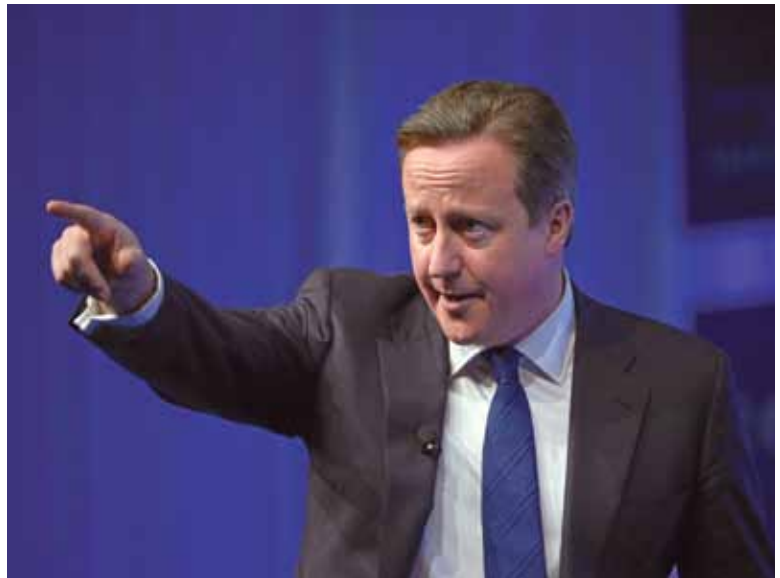
British Prime Minister David Cameron is leading the charge, along with President Obama, for a rush to judgment against President Putin for the downing of MH17—without evidence.