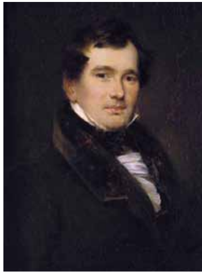
Henry C. Carey (1793-1879)

"Two systems are before the world. One looks to pauperism, ignorance, depopulation, and barbarism, the other to increasing wealth, comfort, intelligence, combination of action, and civilization. One looks towards universal war, the other to universal peace. One is the English System, the other we may be proud to call the American System, for it is the only one ever devised, the tendency of which was that of elevating while equalizing the condition of man throughout the world. Such is the true mission of the people of these United