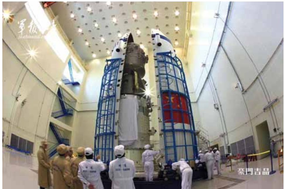
China’s space program has the potential “to totally transform our relationship to the solar system and beyond.” Here, a launch at the Jiuquan Satellite Launch Center.

In discussing this with LaRouche today, he said: Look, you have to take this thing from the top. If you’re going to look at the planet, you have to start with the stellar example of unleashing the kinds of forces and productivity which can pull the planet back from the brink of extinction, both economically and militarily. And that example, he said, is China, with its lunar program, which involves mining helium-3 on the Moon, for the purposes of achieving a complete transforma-