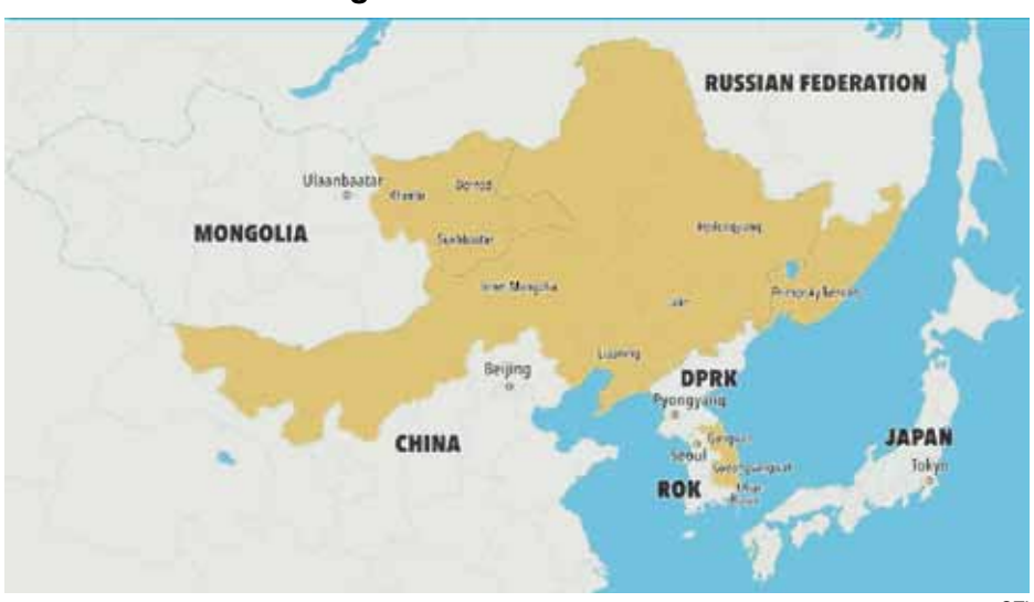
FIGURE 2 The Greater Tuman Region

The GTI region ( Figure 2 ) encompasses: the Chinese provinces of Liaoning, Jilin, and Heilongjiang, as well as the eastern portion of Inner Mongolia; North and South Korea; Russia's Primorsky Territory, the Far Eastern Federal District, and Khabarovsky Territory, as well as the Amursky Oblast, the Jewish Autonomous Oblast, and the