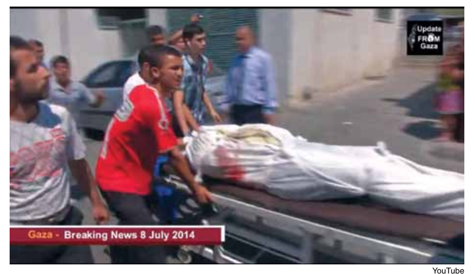
Israel is committing war crimes and crimes against humanity in its murderous assault on Gaza. Here, an image from the Gaza Strip on July 8.

Vice President under Saddam Hussein, who leads the Men of the Army of Naqshbandi Order, a militant Sunni group that has allied with ISIS, and forms a backbone of the insurgency that has taken over large parts of the country's north. Soon after the release of the tape, unidentified armed men assaulted an apartment building in Baghdad, killing 26. The incident has raised speculation that ISIS, which has infiltrated fighters into the heavily Sunni northwest neighborhoods of the capital, is now launching a terrorist offensive inside the city.