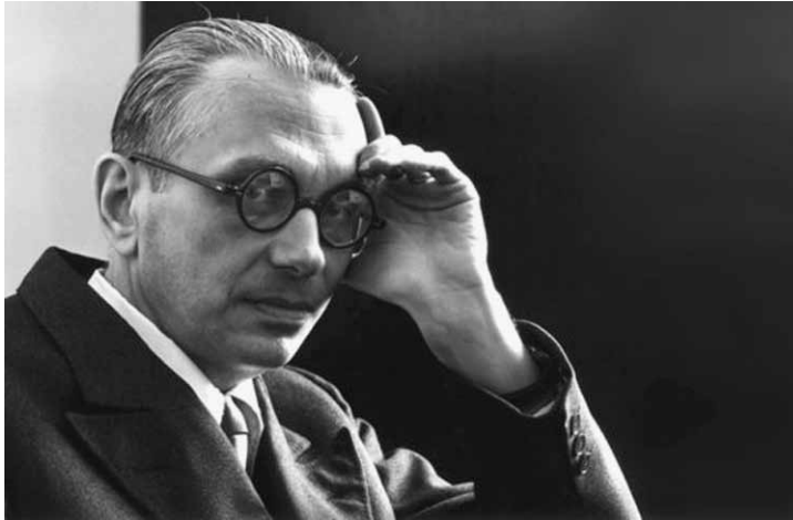
Kurt Gödel, whose 1931 proof jammed up Russell's attempts to reduce creative human thought to the sterile laws of logic.

Gödel proved that the universe rejected Russell's attempts to reach the "end of science." What's more, he proved that Russell's system itself (and any similar logical system) rejected Russell.