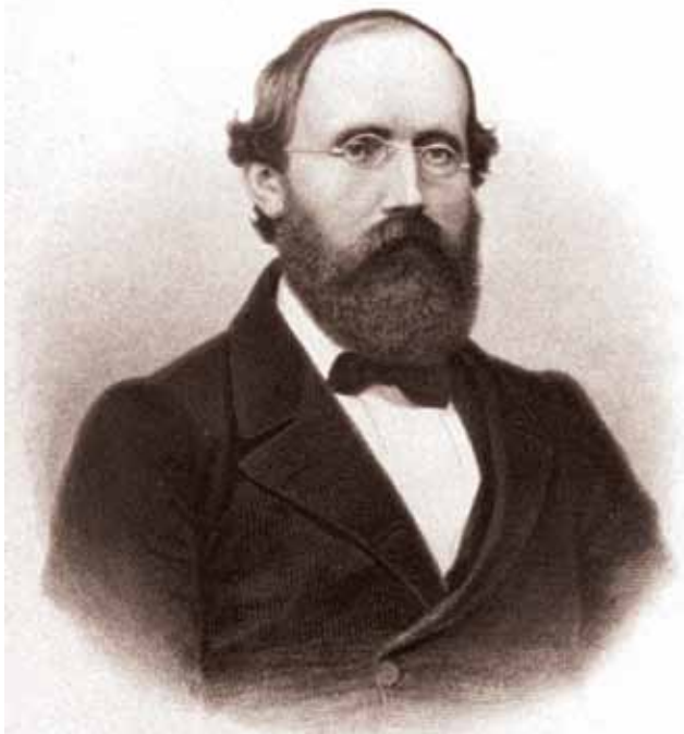
Bernhard Riemann's 1854 habilitation dissertation was a masterful, explicit demonstration that Euclidean geometry does not represent reality, and that its deductions do not represent the human thought process.

(parallel) postulate, meaning that his geometry does not actually describe physical space. The more important, second error, was that in presenting his geometrical truths as deriving from initial axioms, the discovery process by which they were originally arrived at was obscured, and a false one (deduction) was presented in its place.