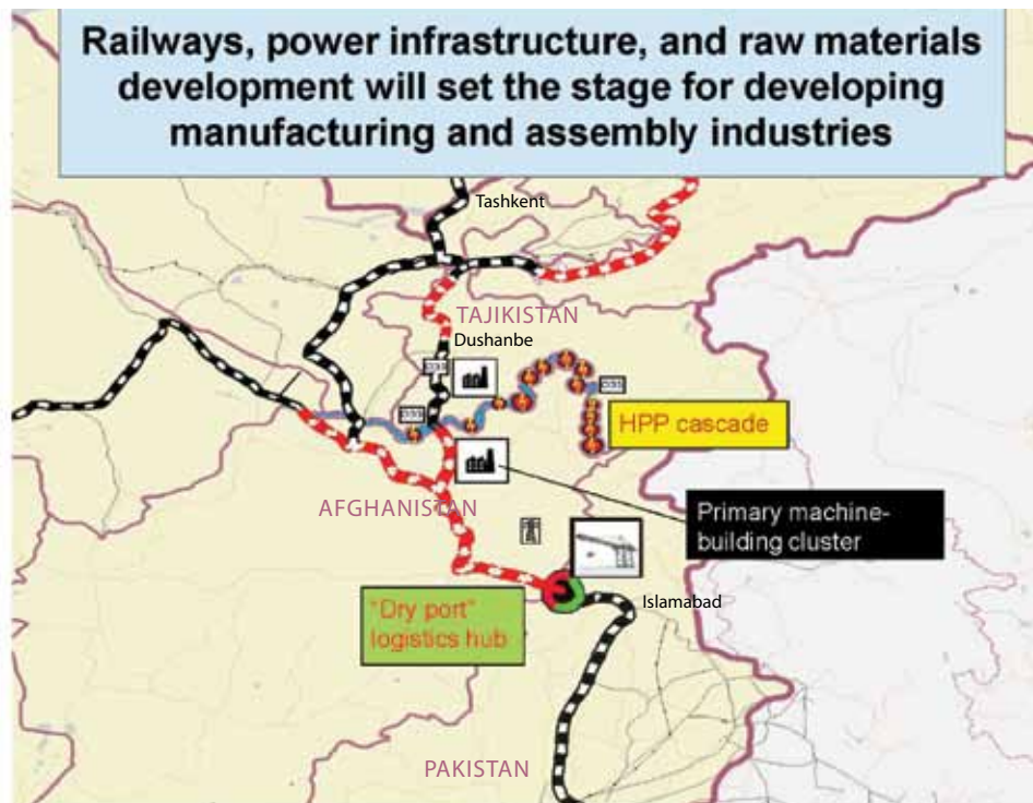
Broken lines on the map show existing (black) and proposed (red) railroads. A “dry port” logistics hub at the Pakistan-Afghanistan border, along a new Indian Ocean-to-Siberia rail corridor, would include switchover between narrow and wide-gauge railroads. The “HPP cascade” is the proposed series of hydroelectric power plants on the Panj River, which forms the Afghanistan-Tajikistan border.

In closing remarks at the Moscow conference, Deputy Director of the FDCS Oleg Safonov brought up the need for Russia to move ahead quickly with creation of a Central Asia Development Corporation (CACD). This scheme was proposed by Victor Ivanov in early 2012, 6 in line with President Vladimir Putin’s advocacy of setting up state-led corporations for large, integrated economic development programs in key geographical areas. Safonov said that the government-owned VEB Bank, one of Russia’s largest financial institutions, should play a key role in the CACD.