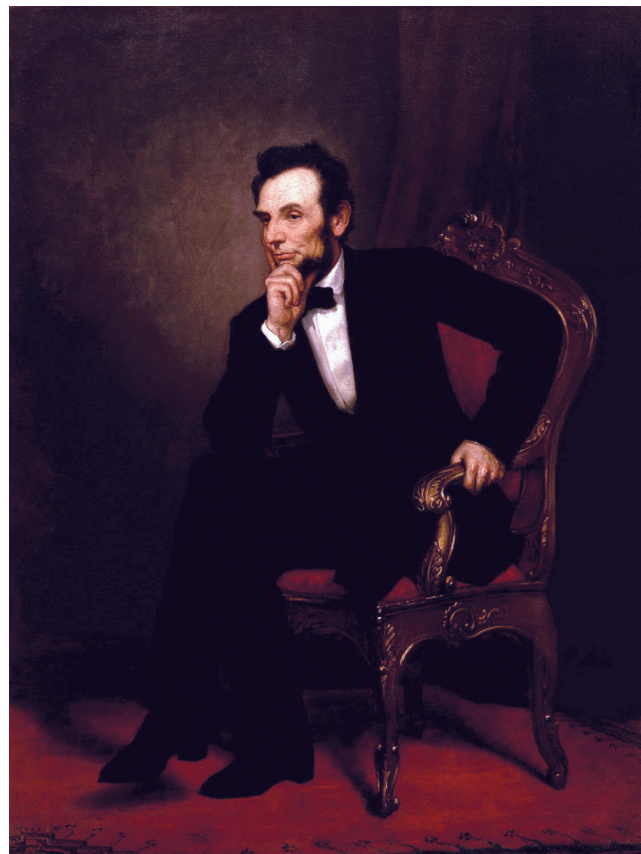
Without President Abraham Lincoln’s “greenback” policy, an echo of Hamilton’s genius, the British would have succeeded in destroying the United States, “as if with a virtual single blow.” Painting of Lincoln by George Peter Alexander Healy (1869).

He had designed what would be, in his intention, later, a precise echo of Hamilton’s scientific genius: a precise echo, today, of what had been President Abraham Lincoln’s strategically crucial “greenback” policy. Without that Lincoln “Greenback” policy (from which a truly wise United States would have otherwise never returned), what the British had intended, would have succeeded in destroying the United States, that as if with a virtual single blow. Without the pure genius of the greenback policy: a policy which had been in accord with the systemic genius expressed as by President John Quincy Adams, and President Franklin Roosevelt’s Glass-Steagall reform. The United States is