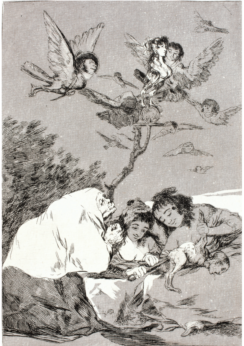
Francisco Goya, "All Will Fall," from "Los Caprichos" (1797-99).

This Obama situation smells as if Adolf Hitler's ghost were occupying the body (in the absence of a true mind) of our current U.S. (virtually British) puppet-President Obama. Meanwhile, our own frightened political cowards and opportunists, adapt themselves to both their waning hope for personal greed, but also with an increase in their fears of the monster who is the current U. S. President. The price of giving in to their frankly understandable, but still unforgivable fears, now threatens the probable extinction of the human population of this planet. We are, thus, obliged to fight for the regaining of the freedom which had been taken from us by the junior Bush (i.e., Cheney) and Obama Administrations.