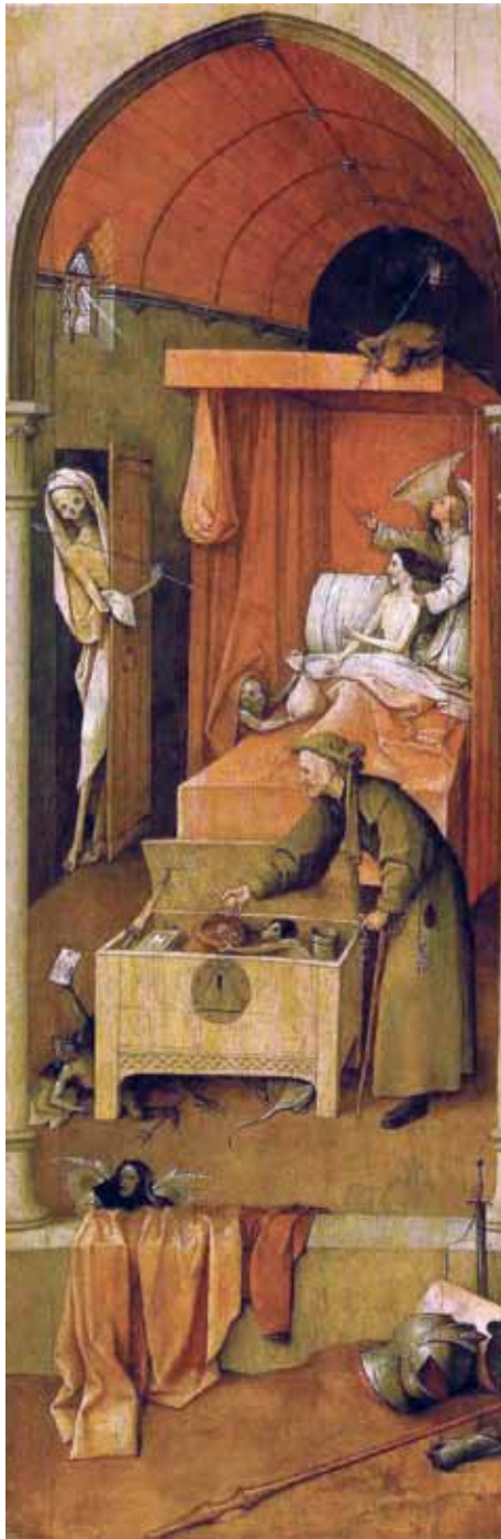
The Wall Street accountants' disease: "Death and the Miser," by Hieronymus Bosch (ca. 1494).

Coward that he was, Hamlet had let death itself do the dirty work, while he watched himself go dead, gloating, so, at the evil pleasure of his love-hate pain of death, and his own mounting murders of his selected victims, even while his own mouth's prattle ran on, meaninglessly, until the dying juices of life might mock even his own death as never anything but a wasteful thing: a true coward to the end, staring forever, eyes wide open, but soon glazed forever. Too evil to know virtue, and too wicked to die honorably; he let Satan himself deliver him from pain to meaninglessness. The insights I admire in Shakespeare's work, are rarely accepted for their truth. That is the greatest irony of his work in all, when that result is placed on a foolish stage.