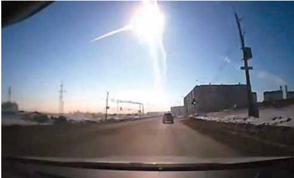
The meteor explosion over Chelyabinsk, Russia, Feb. 15, 2013. The threat posed by such near-Earth objects is increasing, and requires urgent international action.

fective defense of life on Earth, difficulties which were already increasing during the 1970s, but had entered a threatened collapse-phase with the retirement of President Ronald Reagan, now pose a monstrous threat to continued human existence. We have gone backwards in net physical-economic capabilities since the close of the 1960s.