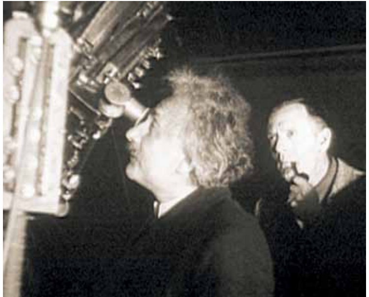
California Institute of Technology

Albert Einstein with Edwin Hubble at the Mount Wilson Observatory in California, 1931. "All the great discoveries of physical principle in the universe are embodied in the costume of great, universal physical principles," writes LaRouche, such as those of Einstein and Max Planck.