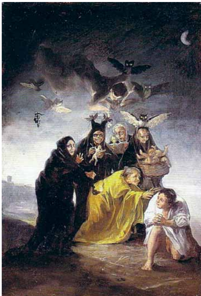
"A small coterie of brutish women" surrounds Obama. Painting by Francisco Goya, "The Spell" (1797-98).

To understand such diseases of the mind; the flight into insanity or even sudden death, sought to escape the terrors of the night, which live, instead, within the progress of the day. The possession by the mere idea of money devours the human soul by day, and by the victims of the night: all this systematically. So, in the lust for money, the terror of not having more money, may