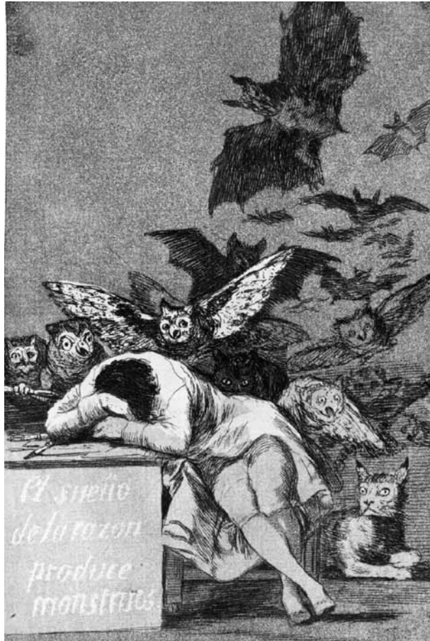
Francisco Goya, “The Sleep of Reason Produces Monsters,” from “Los Caprichos” (1797-99). “The financial world is . . . a nightmare, inherently. Call it, not a nightmare, but a might-mare: you are dead, and being tormented in Hell, and fear there is no escape, not even by dying!”

Animals are, by comparison, relatively innocents; they have no efficient capacity for comprehension of a non-bestial modality in life. Animals, at their very best, are what mankind might make them enabled to do. This natural distinction of human from beast, or, humanoid beasts such as the Roman and British empires in the Zeus-ian traditions, are not the mere sinner, but are essentially bestial in their behavioral characteristics, as