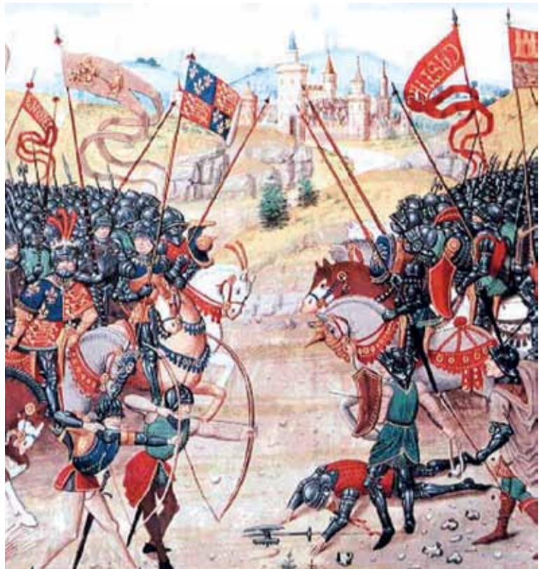
The Battle of Agincourt

Into a thousand parts divide on man, And make imaginary puissance; Think when we talk of horses, that you see them Printing their proud hoofs i’ the receiving earth; For ’tis your thoughts that now must deck our kings, Carry them here and there; jumping o’er times, Turning the accomplishment of many years Into an hour-glass: for the which supply, Admit me Chorus to this history; Who prologue-like your humble patience pray, Gently to hear, kindly to judge, our play.