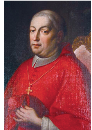
Nicholas of Cusa

Christopher Columbus, whom it guided on his historic voyage.