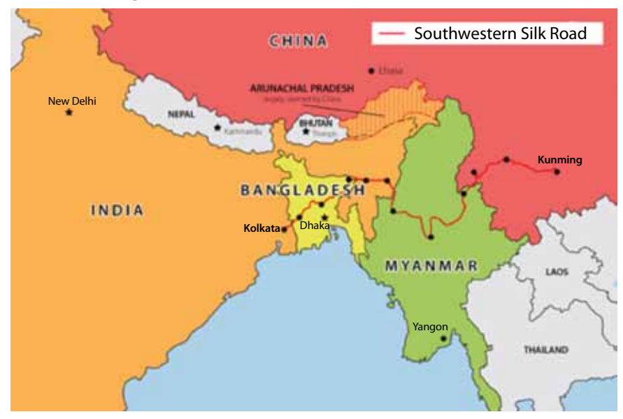
FIGURE 1 The Kunming-Kolkata Economic Corridor

fickers, and with the departure of these troops, there is a great deal of fear in the region that these terrorists will turn toward the East, toward Russia, towards the Indian part of Kashmir, and also toward the western part of China, which is Xinjiang province.