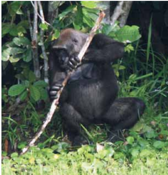
T. Breuer, M. Ndoundou-Hockemba, V. Fishlock (2005) A gorilla uses a stick while catching fish.

That pattern in the post-Kennedy U.S.A.'s continuing relatively qualitative collapse in culture, had coincided with consequent, continuing policy of the Anglo-Dutch tyranny, the which was first established with the subjugation of the British Isles by the Dutch oligarchy: a process based in the developments of the successive stages of that oligarchy's rise to take over domination of the Seventeenth Century and then the captured British Isles, too: thus, so producing the British empire composed of both its Dutch component, and, then, the British Isles, too. Hence, ultimately, the ugly fate produced by those Anglo-Dutch bankers who had dominated the original settlement of Manhattan, and, consequently, had prompted the making of a defeated late-Seventeenth-century Massachusetts, too, and the