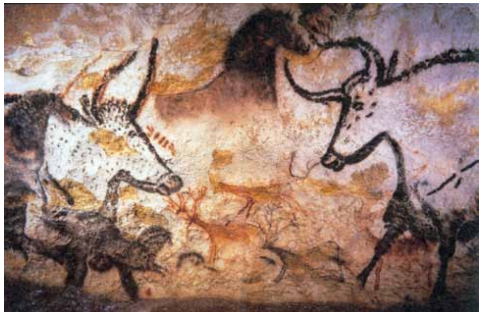
Paintings from the Lascaux Cave in France, estimated at 20,000 years old. Man used fire hundreds of thousands of years before the creation of these paintings, which are "modern" from the standpoint of the development of human creative mentation.

However, with the progress of mankind into the fields of thermonuclear fusion, and a still distant prospect of "matter-anti-matter," too, mankind is forever confronted with a new, contrary, better quality of challenge demanded by our species' prospective, new categories of qualitative steps upwards. The rise of "energy-flux density," for example, is the proper choice of a theme-song of mankind's prospective future. However, presently, we are not yet even nearly prepared for the human occupation of Mars, and similar such stuff. Perhaps, during the second half of Earth's present century, something of a change in that direction of matters might be expected. We should certainly be taking relatively cautious steps into that general direction about