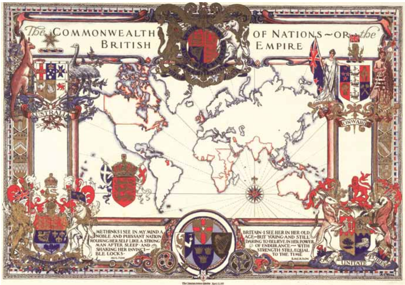
The British Empire in 1937

alien to the principles of the Massachusetts Bay settlements under the rule of the brilliant Winthrops and Mathers during the times prior to the Anglo-Dutch crushing of those brave and wonderful settlements: those were the settlements on which the later establishment of the victorious United States, itself, would have been implicitly premised.