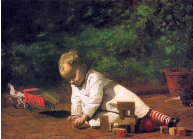
"Mankind is the only species presently known to us which is capable of being defined, precisely, as of the potential quality for voluntary self-evolution of the human species." Shown: "Baby at Play," Thomas Eakins (1876).

entific practice sufficient for providing mankind's growing "intellectual" form of capacity for managing those extended operations pointing to the ability for deliberate development of intellectual powers capable of a blending of direct and indirect operations functioning ultimately on a Solar-systemic scale, this by taking into account the possible case ultimately without the "outer limits" known to us presently.