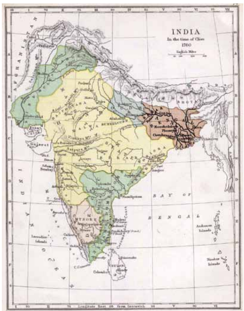
This map shows India in 1760, when it was under the rule of the East India Company's Baron Clive. Ten years later, 10 million Indians in Bengal (highlighted), perished of famine.

the period of the Indian famine that it had created.