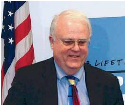
Patriot Act author Rep. James Sensenbrenner demanded of AG Holder: "Does the FBI believe that there are limits on what information it can obtain under [Patriot Act] section 215? If so, what are those limits?"

Veteran Rep. James Sensenbrenner (R-Wisc.), the author of the Patriot Act, argued in a letter to Holder that the leaked order specifically contravened the Act. He demanded that Holder answer four questions by June 12, of which the fourth was, "Does the FBI believe that there are limits on what information it can obtain under [Patriot Act] section 215? If so, what are those limits?"