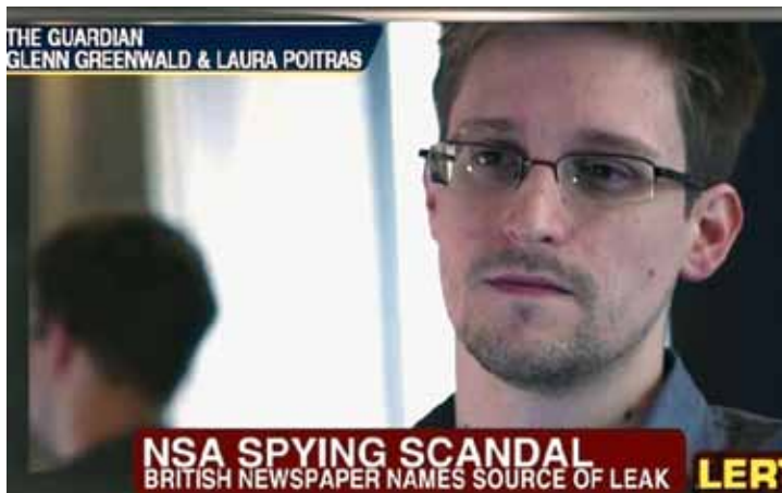
Edward Snowden, a 29-year-old NSA contract employee, is the source of the leak to the Guardian’s Greenwald. He said he believed that the NSA spying posed “an existential threat to democracy.”

Watergate looms, for a President who has violated his oath of office to much worse effect than did President Richard Nixon. But clearly the U.S. population will have to force their Congress to act.