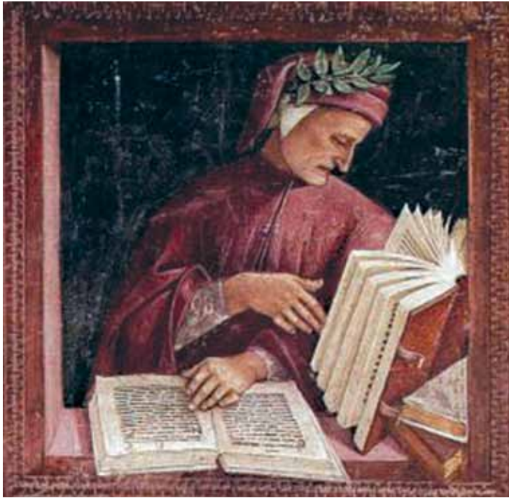
Dante Alighieri and his heirs, such as Filippo Brunelleschi and Nicholas of Cusa, established the foundations of modern European art and science. This portrait of Dante by Luca Signorelli (ca. 1500).

mankind, as within, first, looking at Earth from the space enclosing the relatively nearby regions of our Solar System. My own experience of life since my adolescence, has been filled, increasingly, with an insistent, virtual “knocking-at-the-door” for such an outlook.