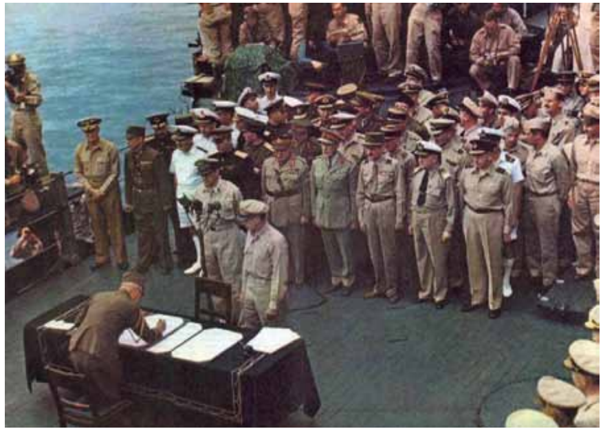
Department of the Navy

At the beginning of our republic's actual crafting of nuclear weaponry's development: from the opinion where I had sat, had been the pledged intention, to avoid any unnecessary presentation, or deployment of such weapons. The opinion in fact of General Douglas MacArthur, in ending the war with Japan, then, and related roles performed by him later, was that the nuclear bombardment of Japan had been unnecessary, and, in fact, a