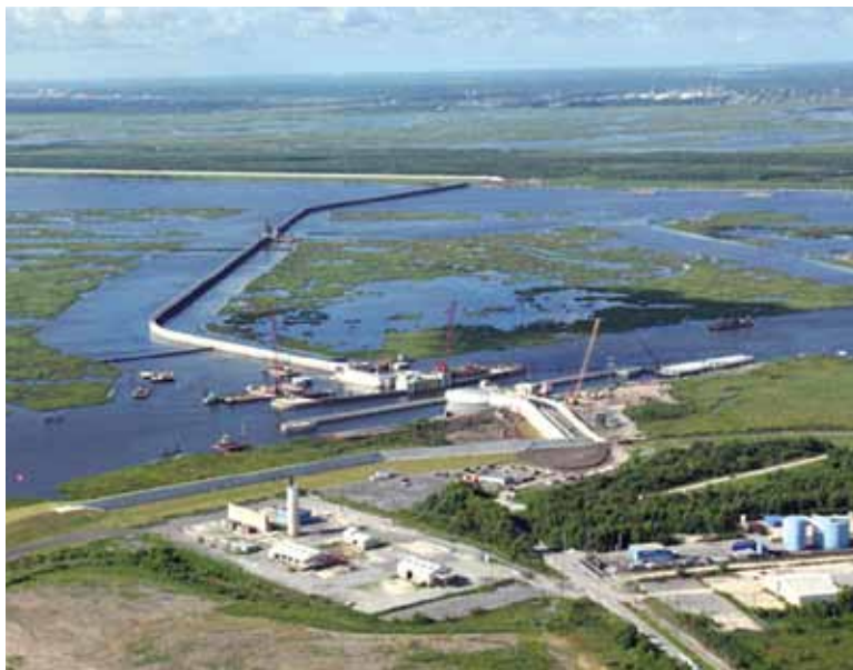
U.S. Army Corps of Engineers