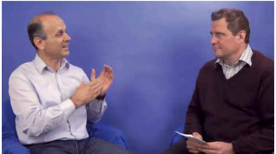
Schiller Institute in Denmark

Gillesberg: So, basically, the military fighting is actually not all over Syria, but is in very few places, where