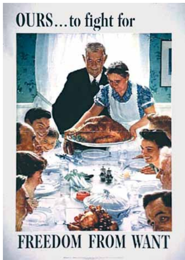
The Constitutional mandate to “promote the General welfare” includes the right of our citizens to an adequate food supply. That right has been trampled by the monetarist “free-market” dogma. Shown: “Freedom from Want,” Norman Rockwell (1943); part of a series illustrating President Franklin Roosevelt’s “Four Freedoms.”

Meantime, the U.S. was entirely food self-sufficient, and a food exporter, apart from the deep tropical products of coffee, coconuts, cocoa, and the few others.