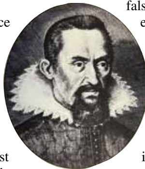
Johannes Kepler (1571-1630)

“This mutual tempering of various influences causes one error to compensate for another, brings the calculation within the limits of observational precision, and makes it impossible to perceive the falsity of this particular hypothesis. And so this sly Jezebel cannot gloat over the dragging of truth (a most chaste maiden) into her bordello. Any honest woman following this false predecessor would stay closely in her tracks owing to the narrowness of the streets and the press of the crowd, and the stupid, bleary-eyed professors of the subtleties of logic, who cannot tell a candid appearance from a shameless one, judge her to be the liar’s maidservant.”