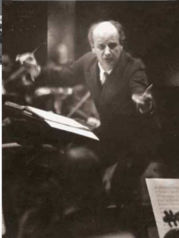
Wilhelm Furtwängler (1886-1954)

The monstrously ruinous effects of the launching of the approximately ten-year U.S. war in Indo-China, had been foreseen by such as General of the Armies Douglas MacArthur, and similar relevant notables in such matters from the past times before the assassination of President John F. Kennedy. That assassination had effects which unleashed a seemingly relentless destruction of the economic opportunities, morals, and quality of opinions throughout the trans-Atlantic world since that time. Now this poor trans-Atlantic world of ours has reached a threatened virtual bottom, seemingly a mere few steps away from a virtually seismic, still accelerating breakdown-crisis of the trans-Atlantic world, or something even much worse.