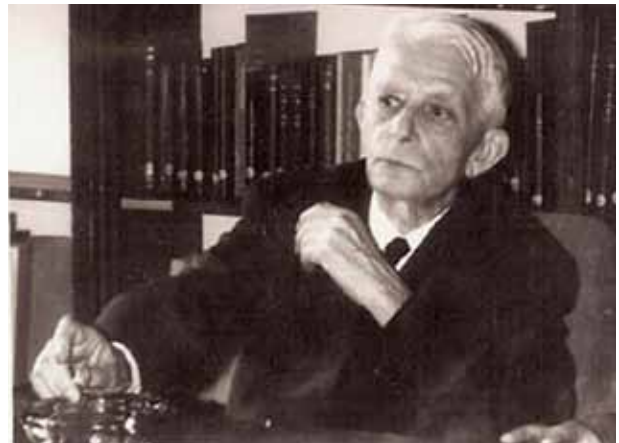
Wolfgang Köhler (1887-1967)