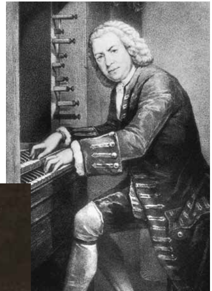
Johann Sebastian Bach (1685-1750)

The work of these three truly outstanding geniuses, Nikisch, Furtwängler, and Bach, LaRouche writes, is rooted in the revolution launched by Bach. “The crucial turn in this pattern, has been shown to have been Bach’s basing compositions on the principle of the future idea yet to be actually heard: the principle which pops up explicitly as afresh.”