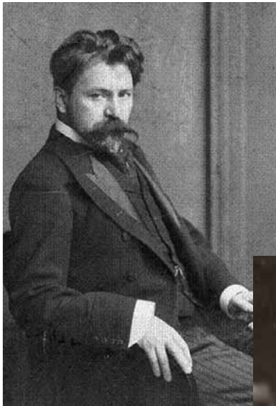
Arthur Nikisch (1855-1922), conductor and mentor of Furtwängler

The work of these three truly outstanding geniuses, Nikisch, Furtwängler, and Bach, LaRouche writes, is rooted in the revolution launched by Bach. “The crucial turn in this pattern, has been shown to have been Bach’s basing compositions on the principle of the future idea yet to be actually heard: the principle which pops up explicitly as afresh.”