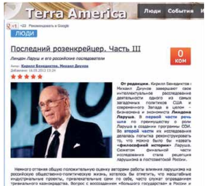
The Russian-language Terra America website, dated May 16, 2012, featuring the final segment of its five-part series on Lyndon LaRouche.