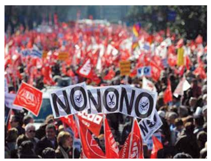
Spain's banks have billions, if not trillions, in non-performing debt sitting on their books, which could implode at any moment. The draconian cuts in spending and living standards have only made things worse. Here, more than a million Spanish workers take to the streets across the country in protest, February 2012.

been cobbled together to help bail out the Eurozone banks. That fund in fact does not exist, but even if it did, it would cover less than 5% of the non-performing assets on the banks' books.